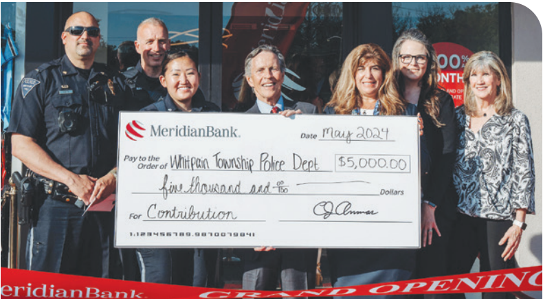
▲ Whitpain Police