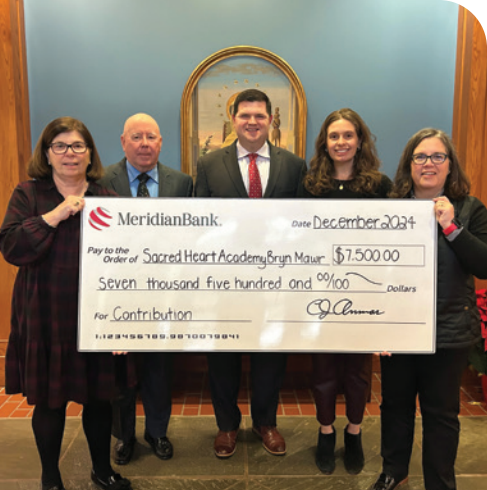
▲ Sacred Heart Academy Bryn Mawr